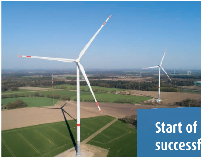
Wind turbines Nordex N149