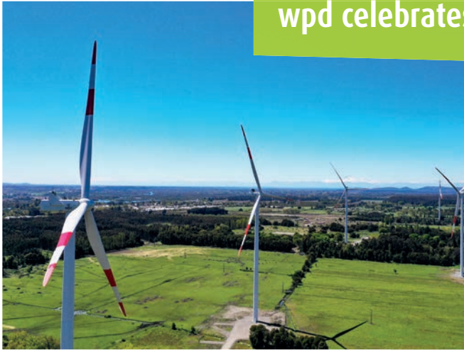
Wind turbines of the Negrete wind farm shortly before commissioning

The Negrete onshore project in Chile celebrated its commissioning in mid-March. Together with turbine manufacturer Vestas, the initial feed-in of the wind farm officially designated as “Parque Eólico Negrete” was achieved via an existing transformer substation. The first project of wpd Chile is thus entering commercial operation.