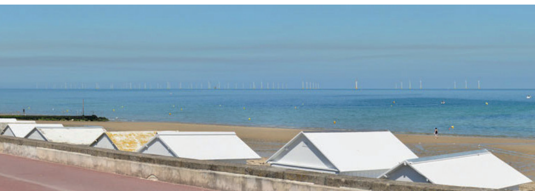
Photo composition Calvados wind farm

Thus, in the not too distant future, Fécamp will be the second and Calvados should be the third offshore wind farm in France to be put into operation. The fact that wpd and the French team laid important foundations for both projects from 2007 onwards, overcame decisive hurdles and are now refining the projects until completion, distinguishes the company and all those involved as pioneers of the French offshore wind market!