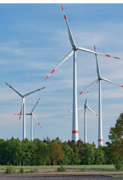
Wind farm Langwedel in Lower Saxony

“For the first time, we have the chance to generate direct value added for the