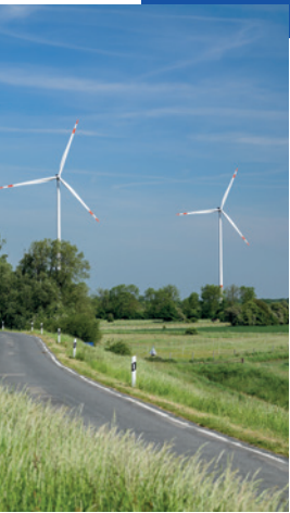
Turbines in the Achim-Bollen wind farm

Since 1 January 2023, with the amendment of the Renewable Energies Act (EEG), direct payments from the operators of wind farms to municipalities have been permissible and legally secure for the first time. Payments are allowed up to a maximum amount of 0.2 ct/kWh. In a windy location, a modern turbine can generate on average around 15 million kWh of green electricity a year. On paper, that is enough to supply around 4,000 households with carbon-free electrical power for a whole year. With a payment of the 0.2 cents per kilowatt hour generated as mentioned, a wind project can in this way also generate around 30,000 euros per turbine in the form of a municipal levy. This will apply throughout the 20 years of its operating life.