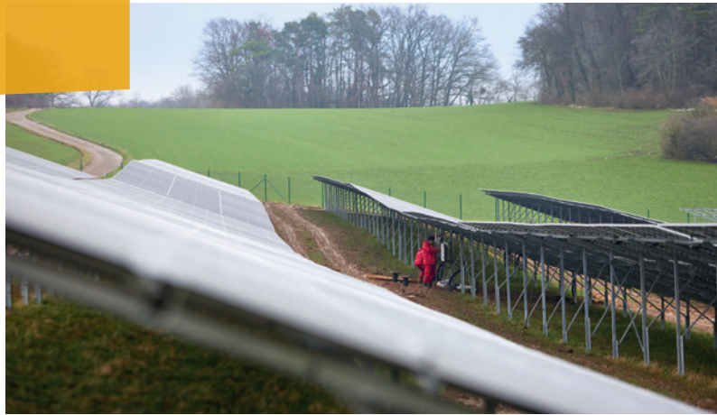
Module assembly in the Wiernsheim solar park

wpd is also continuing to pick up speed in its photovoltaic division. The 10 MWp Wiernsheim Ortental project in Baden-Württemberg was commissioned in March. Construction is due to start on further wpd solar parks in Germany in 2023. The three federal states of Brandenburg, Saxony-Anhalt and Baden-Württemberg will see construction start on projects with a total output of 100 MWp, among them a solar park which will become wpd's largest PV project in Germany with a capacity of 50 MWp. Emerging from a healthy pipeline, further projects will advance Germany's energy turnaround.