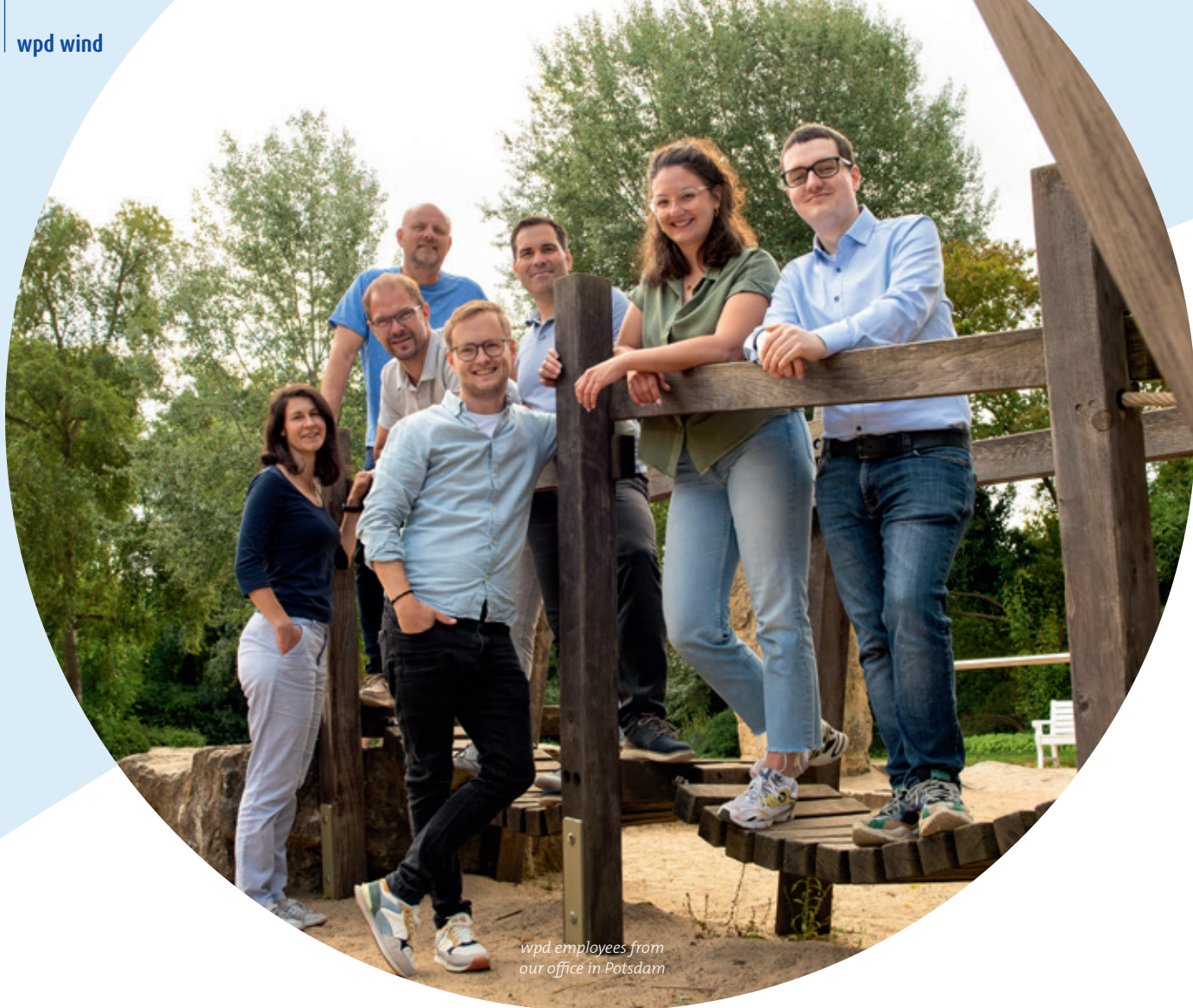
wpd employees from our office in Potsdam

The turbines installed by us in Germany can supply about 2,800,000 households with power.